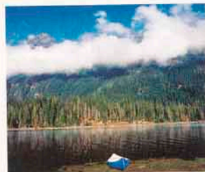
PLUNGE IN: The weather descends on Strathcona, British Columbia.

* MOUNT RAINIER, WASHINGTON On a three-day summit climb with Rainier Mountaineering, Inc. ($795; www.miguide.com ), you'll get a tutorial in basic climbing skills and a guided ascent up the signature peak of the lower 48.